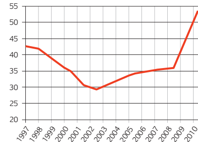
Government debt as % of GDP

As a result of the UK government's £1.3 trillion bailout to the financial sector, the government still owns over £850 billion in bank assets. This figure is roughly equal to the total UK debt.